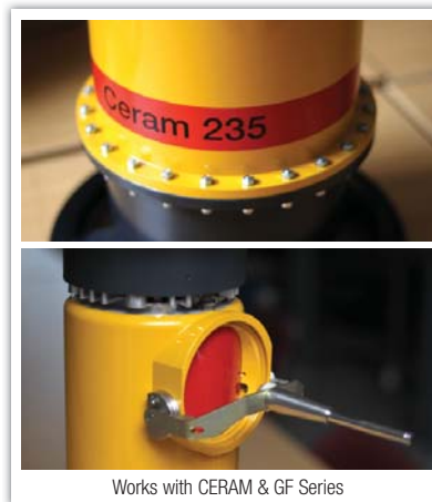
Works with CERAM & GF Series