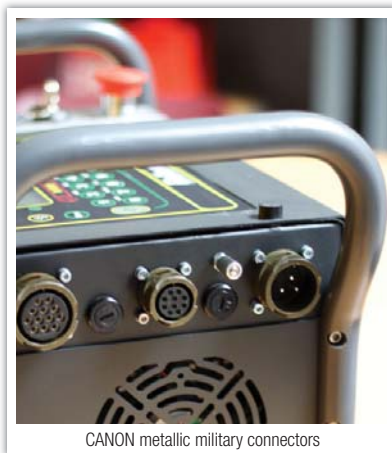
CANON metallic military connectors